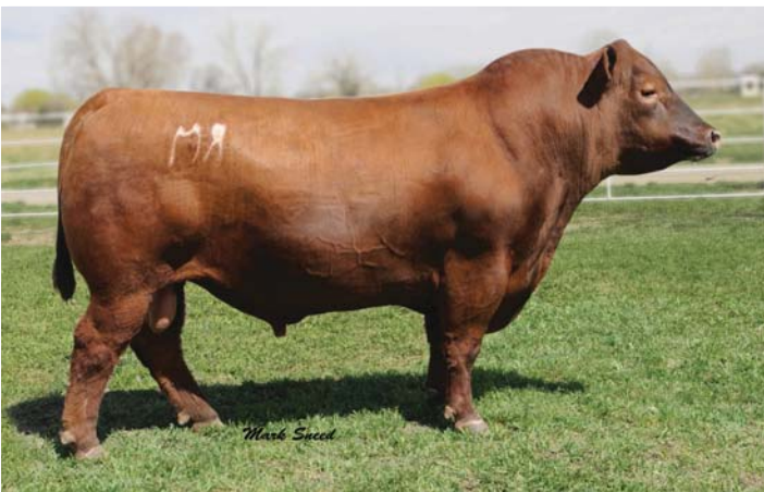
Reference Sire C – Messmer Packer S008

Hustler R588 has proved to be the top calving-ease bull in the breed with growth. R588 sires both saleable calving ease bulls and useful, hardworking replacement females. He ranks on top for Tenderness –iGenity 10 stars. Co-owned with Beckton Red Angus, WY. Semen available from Genex.