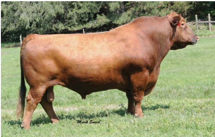
Maternal Grand sire - LJC Mission Statement P27

This Packer son is one of the bulls we are most excited about this year. We used him extensively in our program this year. His dam like Lot 11's raised one of our herd sires as a first calf heifer. Lot 12 is probably the most balanced bull in the sale ranking in the top 26% for BW, 15% WW, 6% YW, 24% ME, 9% Stay, 24% Marb and 1% for REA. His maternal side is one of the best lines of females in our herd in terms of production, consistency, udder development and mothering ability.