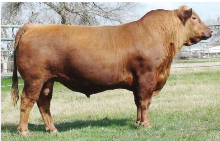
Reference Sire F – Halfmann Dividend U398

One of our best L416 Sons. A good footed, easy keeping bull. He has great length, extremely smooth muscle on a moderate frame that is passing these traits on to his progeny. Co-owned with Silver Spur Ranches, WY. Semen available.