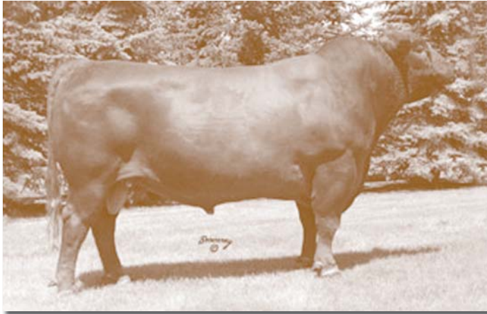
Sire -BJR Make My Day 981

Direct daughter of the famed female-producing Make My Day bull out of one of our original foundation 8207 daughters. Bred to Reference Sire D, Brown Synergy X7838, for a bull with an expected calving date of 3/6/14.