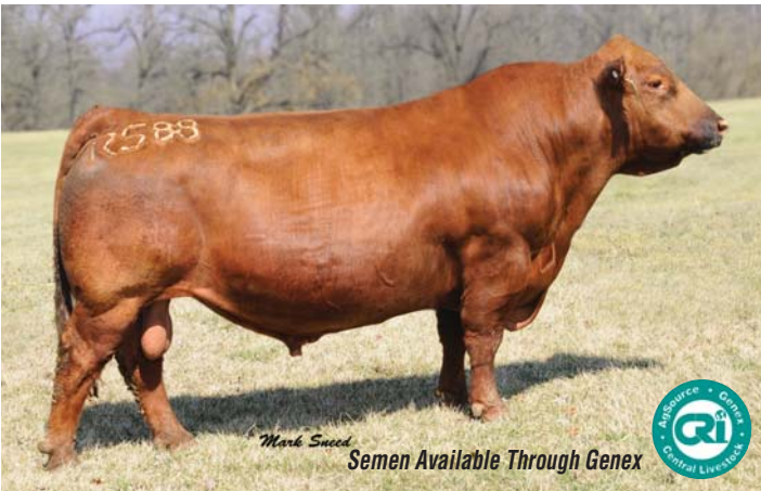
Reference Sire B – Beckton Halfmann Hustler R588

P707 has been setting the Red Angus world on fire as one of the best start to finish bulls in the breed today. Low birth, heavy weaning and yearling weight with high marbling and low maintenance make him a very balanced and herd changing sire. His progeny are very consistent with lots of eye-appeal and thickness. Perhaps his best quality is the quality of females he sires.