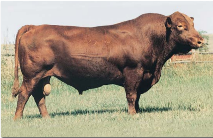
Reference Sire G – Beckton Julian GG B571