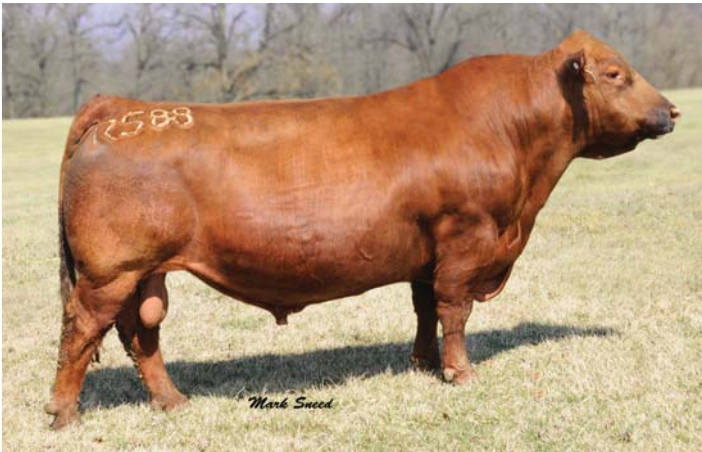
Sire – Beckton HalfmannHustler R588