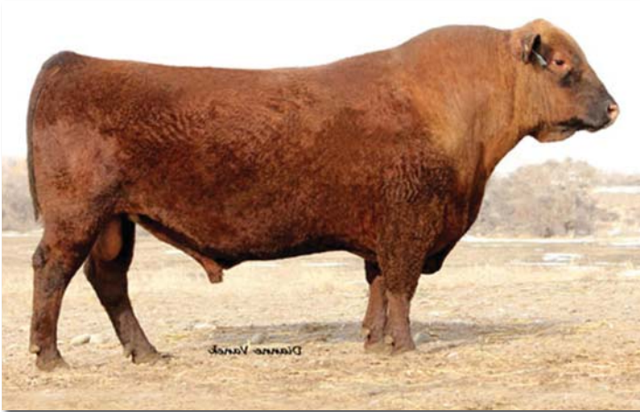
Reference Sire A – Beckton Nebula P707