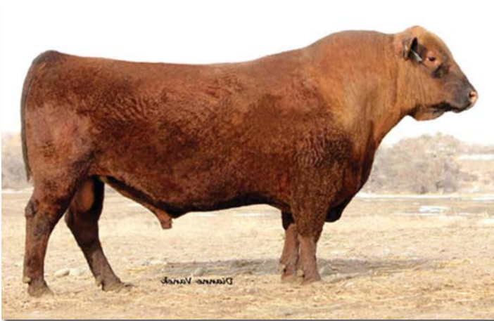
Paternal Grand sire —Beckton Nebula P P707

REG. # 1544866 TATTOO: Z525 BKT BD: 3/27/12 1A 100%