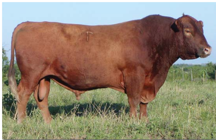
Maternal Grandsire – Halfmann Shrapnel J801