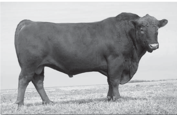
Maternal Grand sire – OLC Chateau L416

Exposed to Lot 21, Halfmann Nebula AQ Y597, 5/25/13 through 7/31/13.