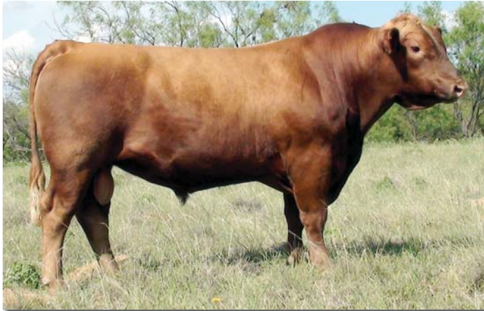
Sire – Halfmann Chateau L610

This set of yearling bulls are out of a group of purebred Red Angus commercial cows that we purchased during the drought. Sired by a very balanced Chateau L610 bull who is in the top 20% for Marb and REA. L610 sons exhibit great muscle and balance (these sons are exceptional examples of just that).