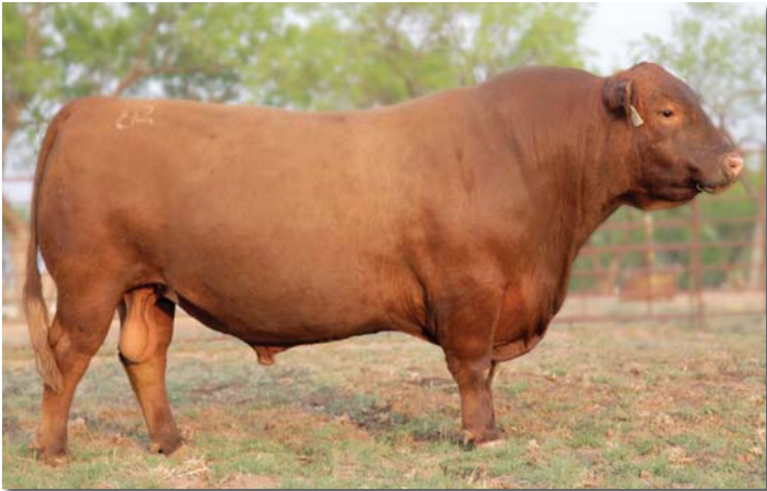
Reference Sire D – Brown Synergy X7838

Synergy is a very balanced P707 son that is loaded with muscle and depth. Low birth with great growth and top stayability and marbling!