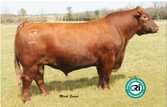
Reference Sire E – Musrush Impressive CA U236

Impressive is a extreme calving-ease, moderate framed bull with muscle.